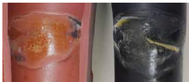
One of the three HV cables at the Grangemouth site where routine testing revealed critical PD activity.

INEOS turned to EA Technology to locate and monitor the PD online, thereby ascertaining the urgency and scope of the PD, and therefore the need for shutdowns and remedial work.