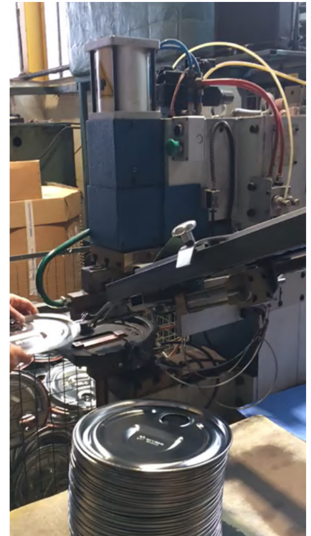
Figure 2: A spot welding machine used to weld handles on to metal lids